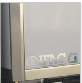
Front beveled angles