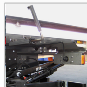
Big doors holders