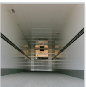
Reinforcement for pallets band built in the panel