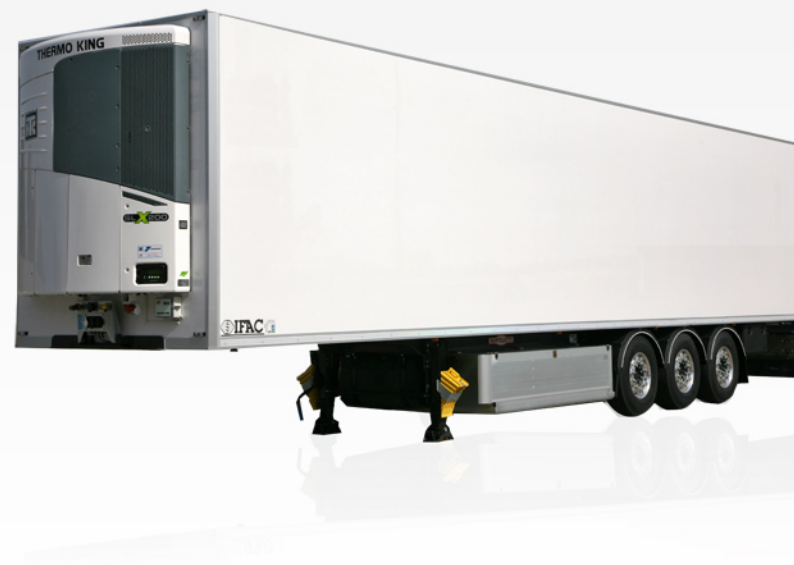
The classic box for long distances.

Greatest capacity, greatest flexibility and greatest durability.