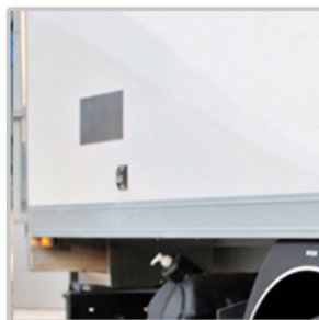
Aluminium/Inox perimeter profiles