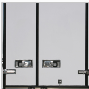
Inox rear locks and recessed/external handles and inox hinges