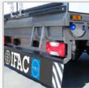
Led marker lights