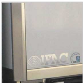
Front beveled angles