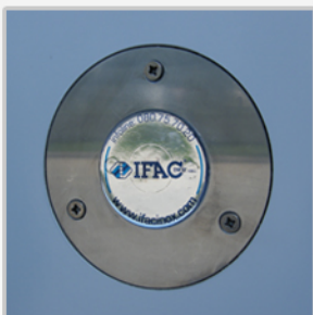
Led lights relight push-button with timer