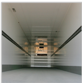
Reinforcement for pallets band built in the panel