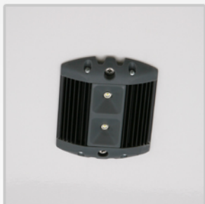
Internal led lighting