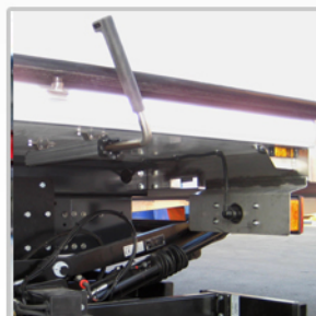
Big doors holders