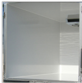
White reinforced and smooth floor