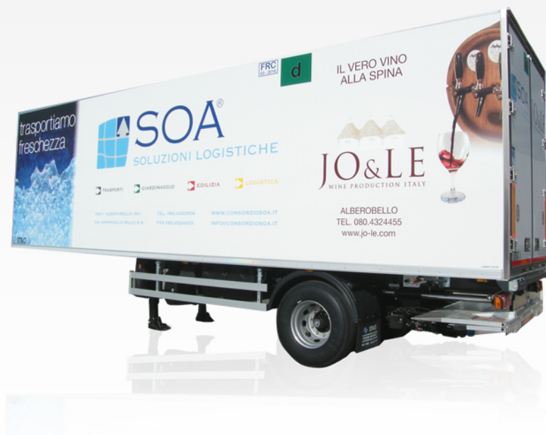
The classic box for long distances.

Greatest capacity, greatest flexibility and greatest durability.