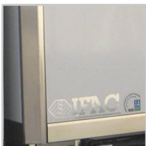
Front beveled angles