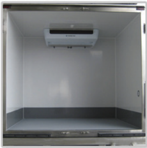
Inox rear frame built in the panels