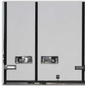
Inox rear locks and recessed/external handles and inox hinges