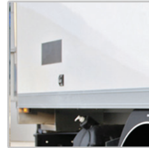
Aluminium/Inox perimeter profiles