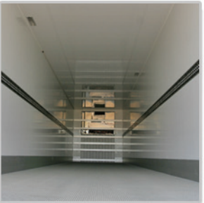
Reinforcement for pallets band built in the panel