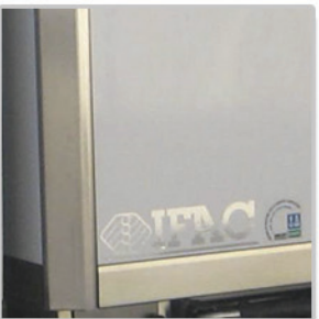
Front beveled angles