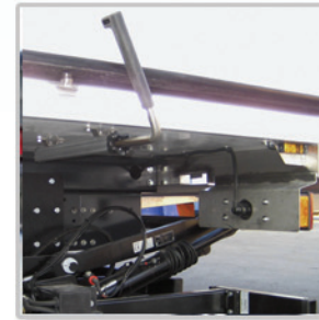
Big doors holders