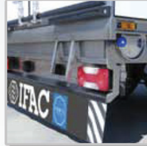
Led marker lights