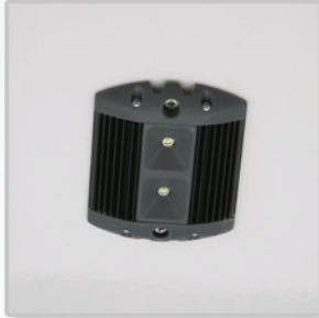
Internal led lighting