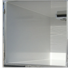
White reinforced and smooth floor